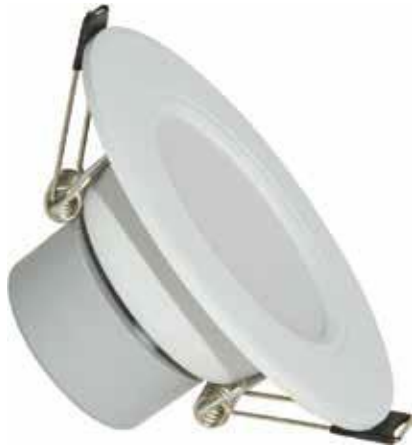
Product Type: ML-DL-12W-BB Product Number: 20