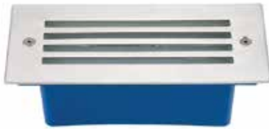
Product Type: LPE-00612 Product Number: 52