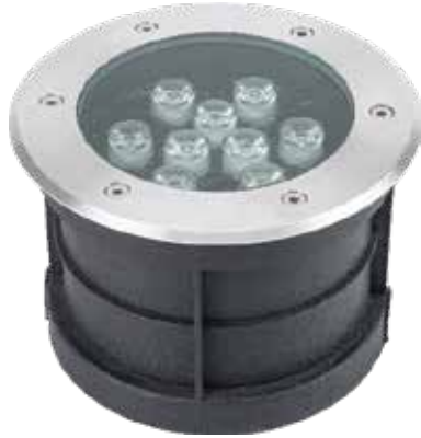
Product Type: LPE-00313 Product Number: 57